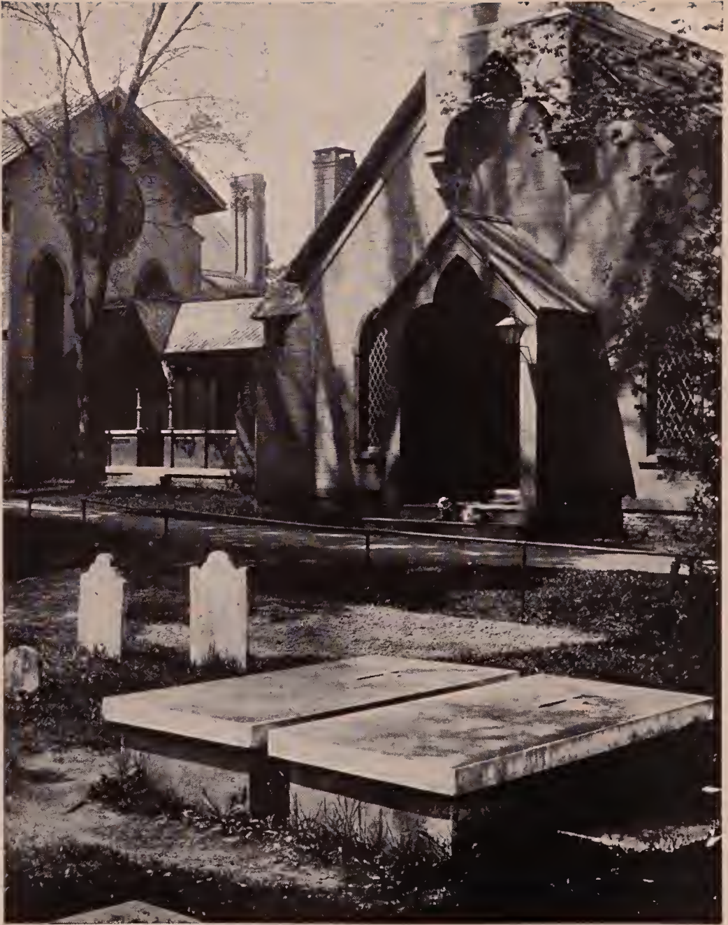
COOPER'S GRAVE, COOPERSTOWN, N.Y.